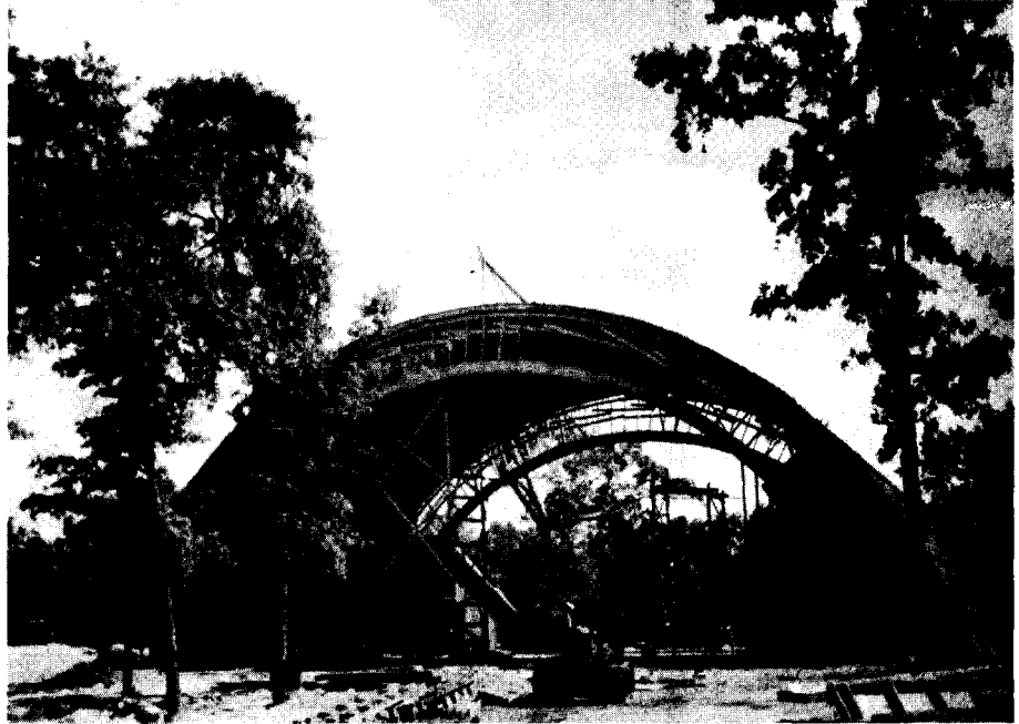
Above is center dome of main auditorium. When completed it will be twice as wide as here shown. Only a third of finished floor space is shown here. It will require the combined effort and sacrifice of all of us to complete it in time for the Feast of Tabernacles.

Lack of sufficient funds has caused work to drag. It will take united effort of all, and real continuous sacrifice, if work is permitted to progress fast enough to have it ready for the Feast of Tabernacles September 24 to October 1.